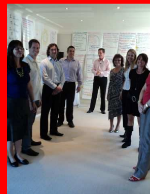
Well trained, happy NLPers...